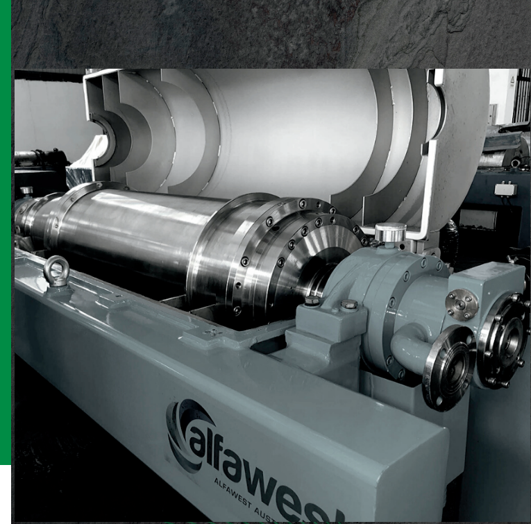
Solid Bowl Centrifuge